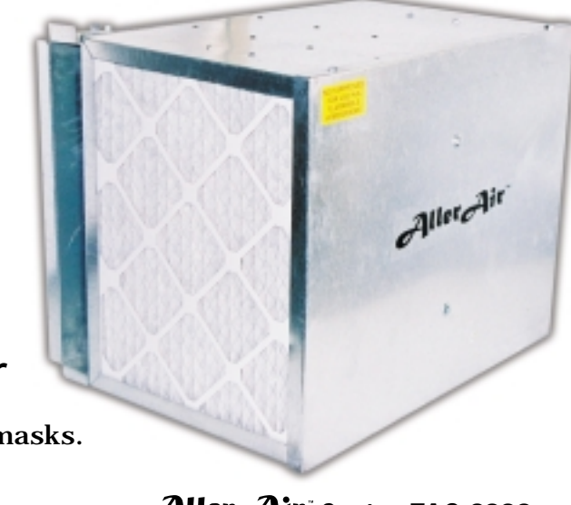
Aller Air Sentry TAC 2000